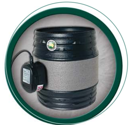
› Poly Motorised Zone Damper