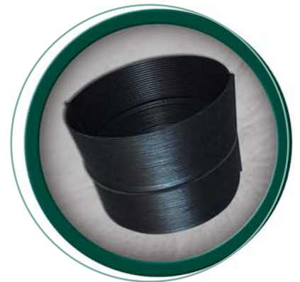
› Uninsulated Poly Connector