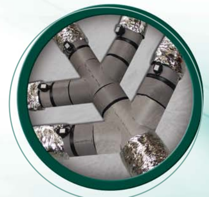
› Totem Pole Connecting System. Utilising Poly Fitting, Poly Connector & Poly Motorised Zone Damper

a Motorised damper with positive shut off to supply with air only the areas / zones required. b Optional - Manual damper blade set by installer maintains the exact amount of air required to service the area once zone damper is activated.