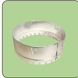
Code Prefix: 8120 Metal Castellated S/Collars