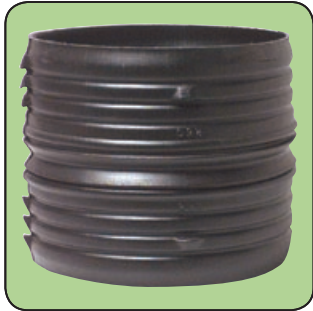
Code Prefix: 7160 Poly Joiners