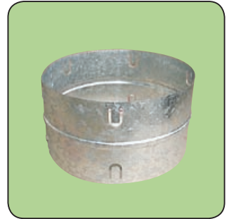
Code Prefix: 8110 Metal Joiners