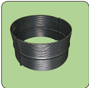
Code Prefix: 7166 Poly Connector Insulated