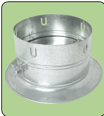
Code Prefix: 8630 Bellmouth Starting Collar & Quadrant