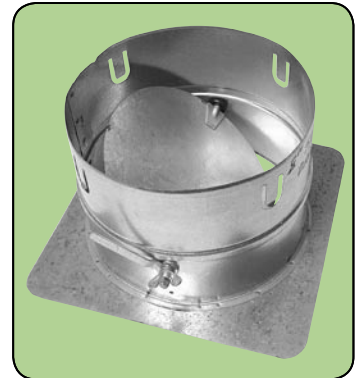
Code Prefix: 8147 Starting Collar on square with H & C Kit