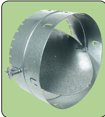
Code Prefix: 8129 Starting Collar & Quadrant (Damper Fitted)