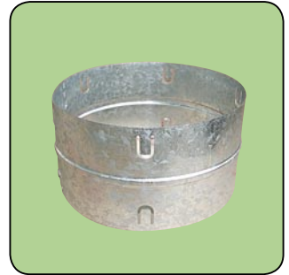
Code Prefix: 8110 Metal Joiners