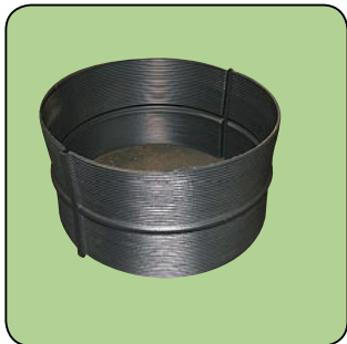
Code Prefix: 7166 Poly Connector Insulated